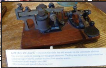
All-Wh (Don't Use Brandy!) This was placed for the old wooden stone cement platform. The device could be raised and lowered by hand. The key was the device used to send the signal message to the other end of the line.