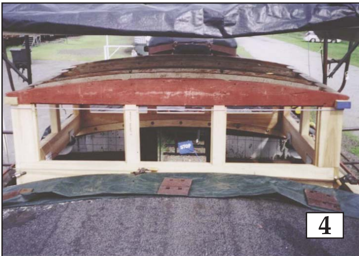
consuming, highly-detailed process which further entailed exactly drilling the holes for the previously fabricated truss rods and bolts. The roof boards were