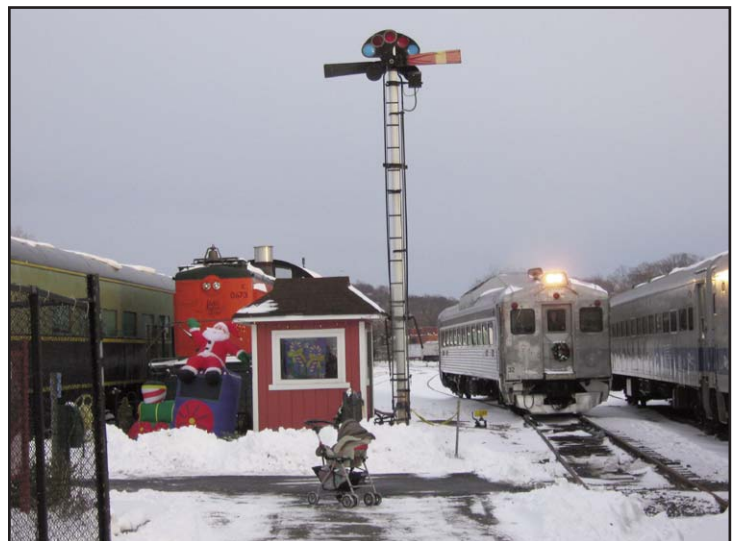
on the last run of the year, ending the Santa Express event.